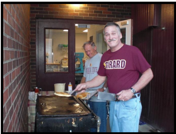
Cooking the pancakes!

Funding scholarships is a large part of the work of the Girard Lions Club and their annual pancake feed is just one of the many activities they sponsor to raise funds for that project and the many others they are involved in around the Girard community.