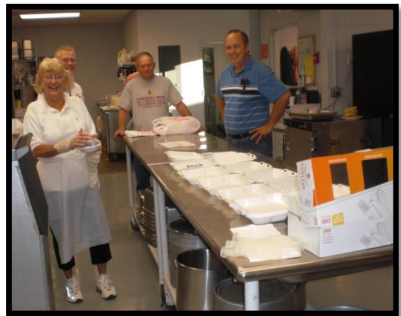
A few of the Girard Lions take a break to have a good laugh during a busy morning of service to the community.