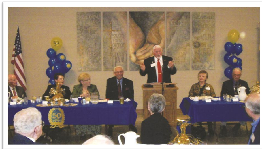
50th Anniversary Pictures (left to right).