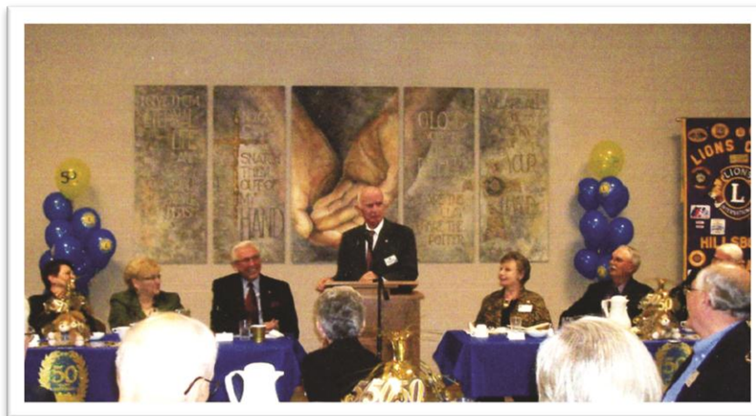
50th Anniversary Pictures (left to right).