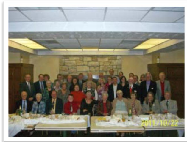
90 th Anniversary group picture celebrated 10/22/2011.