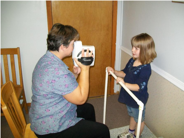
Here are pictures at the Vision Clinic in Girard, Kansas showing the great technology to provide environment enrichment to the low vision.