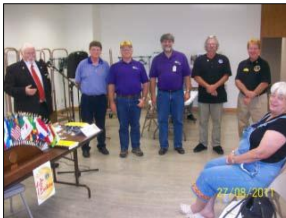
Presidents in attendance at the August 27 meeting receiving I Believe Pins.