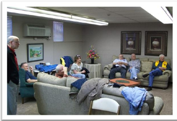
Pictured below are Garnett Lions awaiting training.