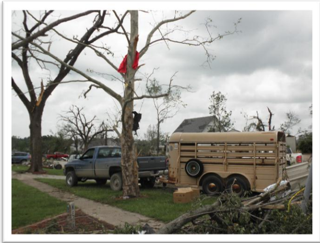
Reading Tornado damage. 11 Emporia Lions bringing supplies